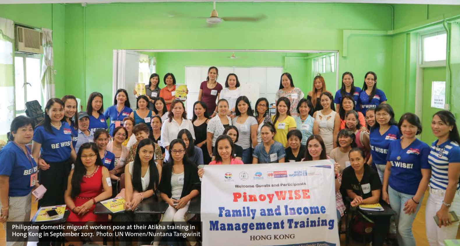
Philippine domestic migrant workers pose at their Atikha training in Hong Kong in September 2017.

The groundswell of regional attention has prompted actions in individual countries. In 2018, government officials of Cambodia, Lao People's Democratic Republic, Myanmar and Thailand convened with UN entities, including UN Women, as well as employers and civil society groups to agree on steps to protect migrant workers from exploitation and abuse. Measures include ensuring that both female and male migrant workers are fully covered by labour and social protection laws regardless of the work they do.