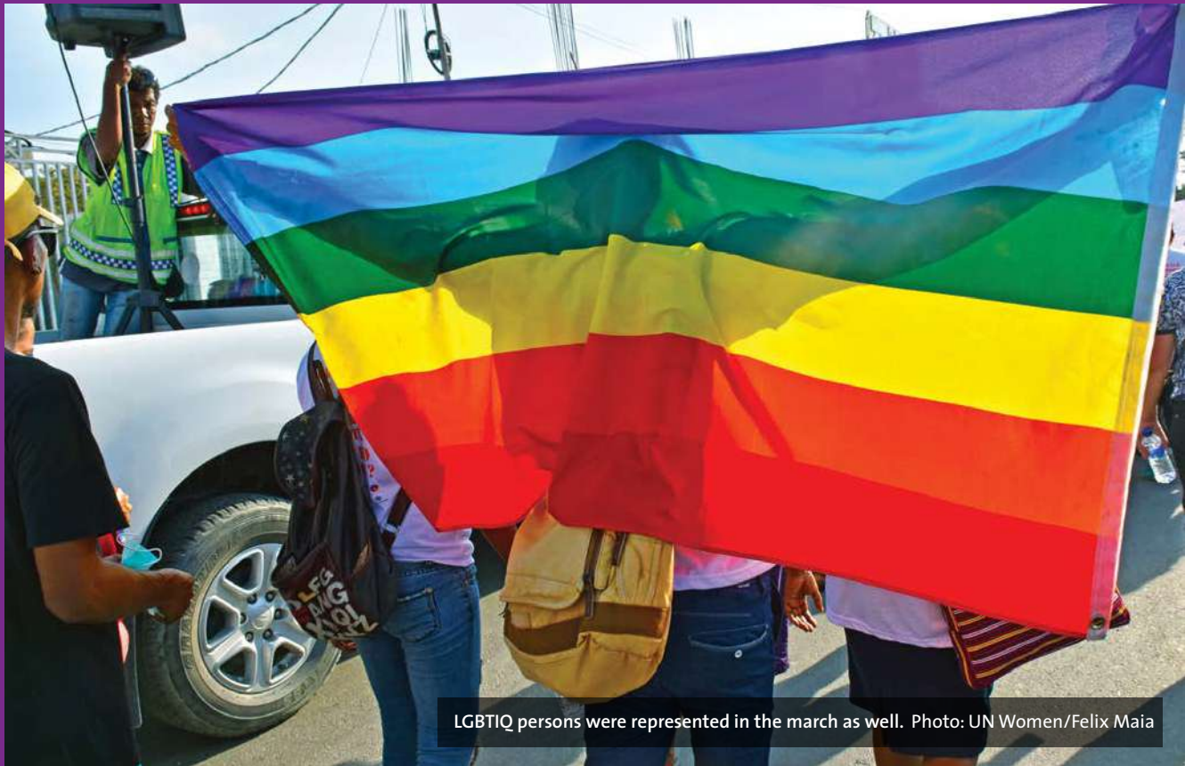
LGBTIQ persons were represented in the march as well.

In disaster settings, women are a lot more vulnerable to gender-based violence, harassment and rape, and that vulnerability is aggravated for lesbian and bisexual women. They are not recognized as part of the village community and not accepted as equals. So not only are they discriminated based on their gender, they are also harassed on the basis of their sexual orientation, and they don't have any mechanisms in place to protect them.