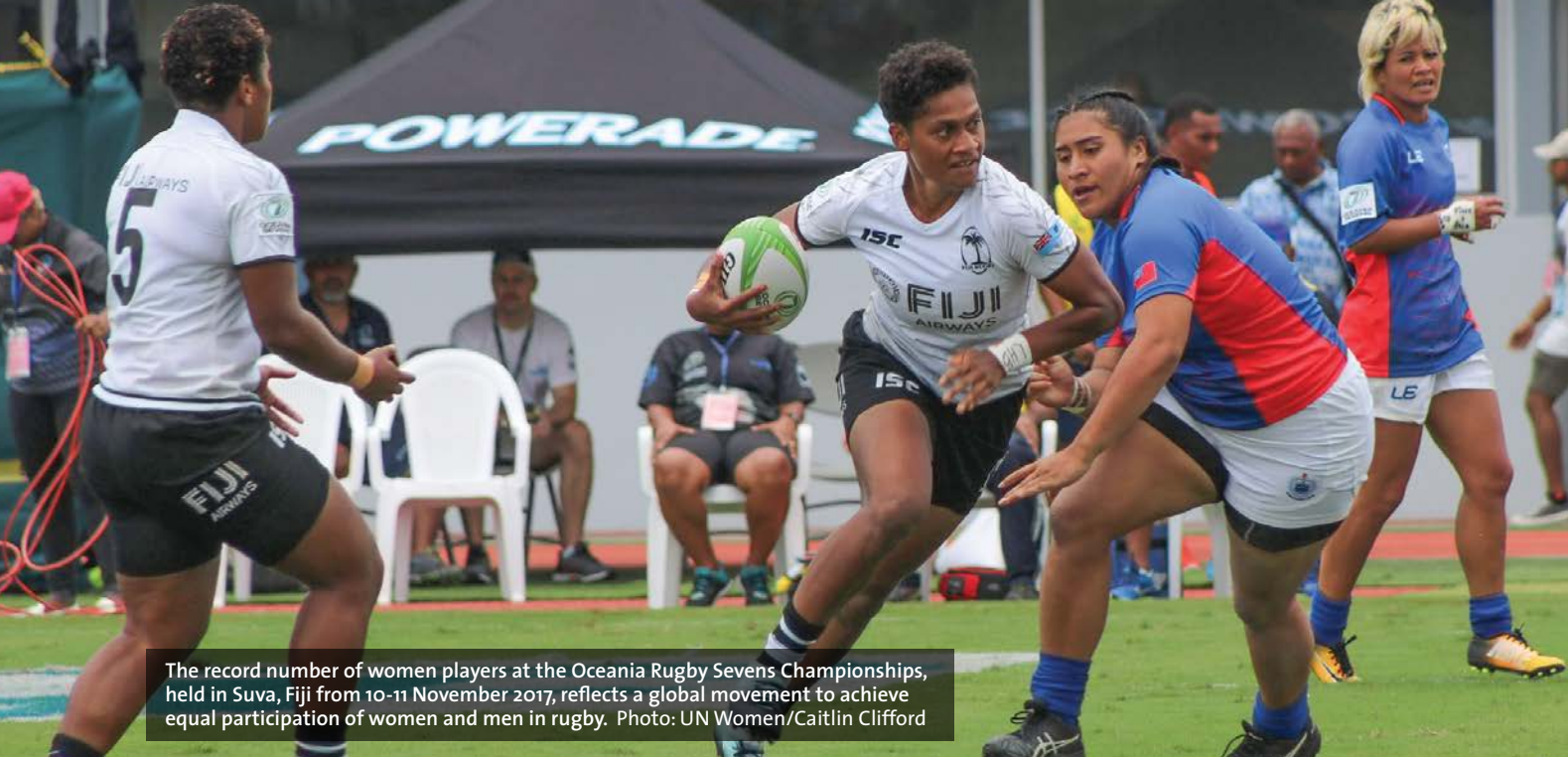
The record number of women players at the Oceania Rugby Sevens Championships, held in Suva, Fiji from 10-11 November 2017, reflects a global movement to achieve equal participation of women and men in rugby.