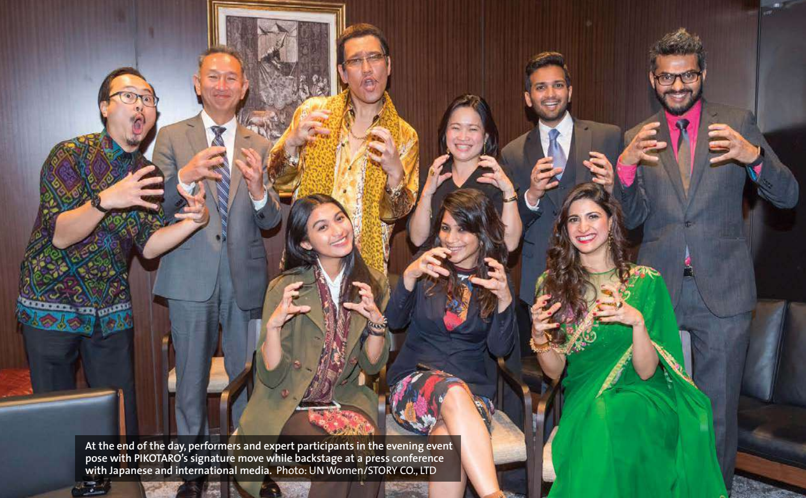
At the end of the day, performers and expert participants in the evening event pose with PIKOTARO's signature move while backstage at a press conference with Japanese and international media.