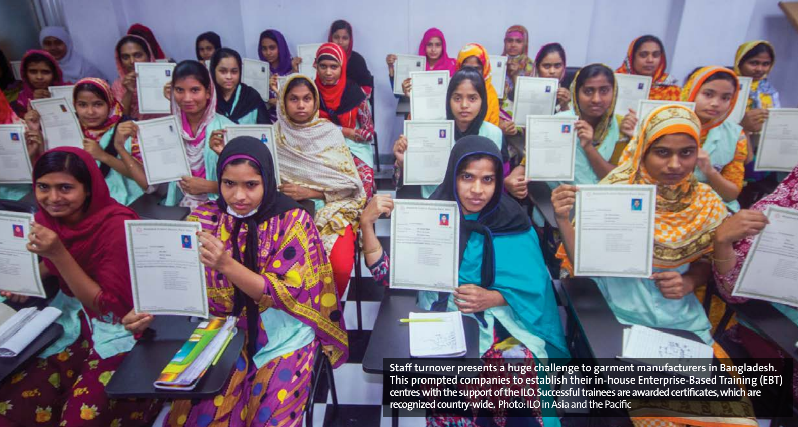
Staff turnover presents a huge challenge to garment manufacturers in Bangladesh. This prompted companies to establish their in-house Enterprise-Based Training (EBT) centres with the support of the ILO. Successful trainees are awarded certificates, which are recognized country-wide.