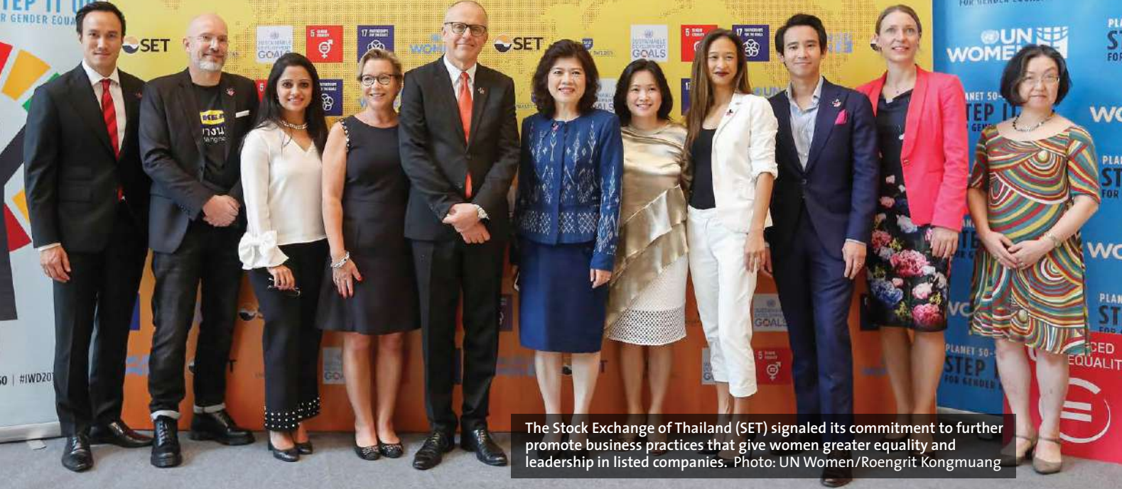
The Stock Exchange of Thailand (SET) signaled its commitment to further promote business practices that give women greater equality and leadership in listed companies.