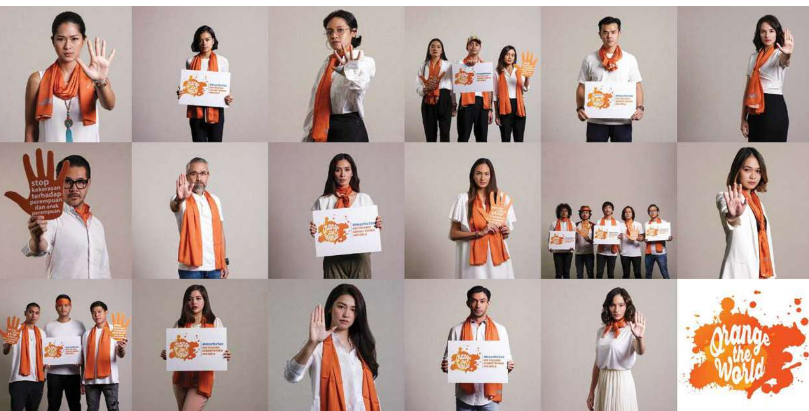
In Indonesia, 25 influencers participated in a video message produced with the objective of encouraging people to take action to end violence against women. In the video, the influencers encourage everyone to stand in solidarity with survivors, speak out, and take action to stop normalizing violence against women and girls. The video was published on 25 November 2018 to mark 16 Days of Activism against Gender-Based Violence.

UN Women, through partnerships with governments and gender equality advocates, has consistently stood behind these efforts. We have helped pioneer new, integrated services that meet the diverse needs of survivors, and advance legislation aligned with international human rights standards. By leading comprehensive research that provides evidence for change, we shift public opinion and inspire actions to remove remaining obstacles to ending violence. While there is still far to go, a new norm is emerging, supporting a vision of a region where every woman and girl can live without fear of gender-based violence.