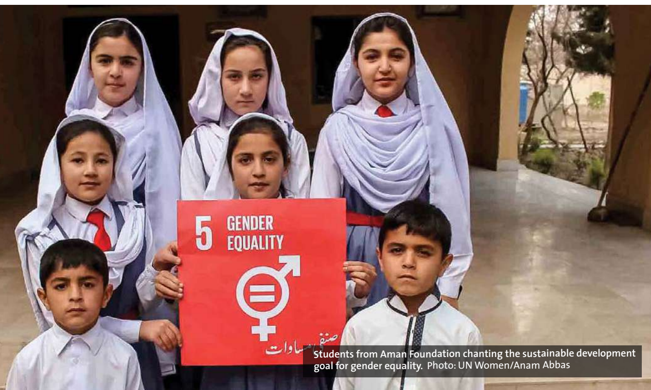
Students from Aman Foundation chanting the sustainable development goal for gender equality.

Women, men, governments, businesses, civil society, international organizations and others all have roles to play. They bring high levels of expertise, influence, commitment and funds necessary to accelerate change. In partnership, they make links to unlock the multiple inequalities that intersect in women's lives, and reach those otherwise left behind.