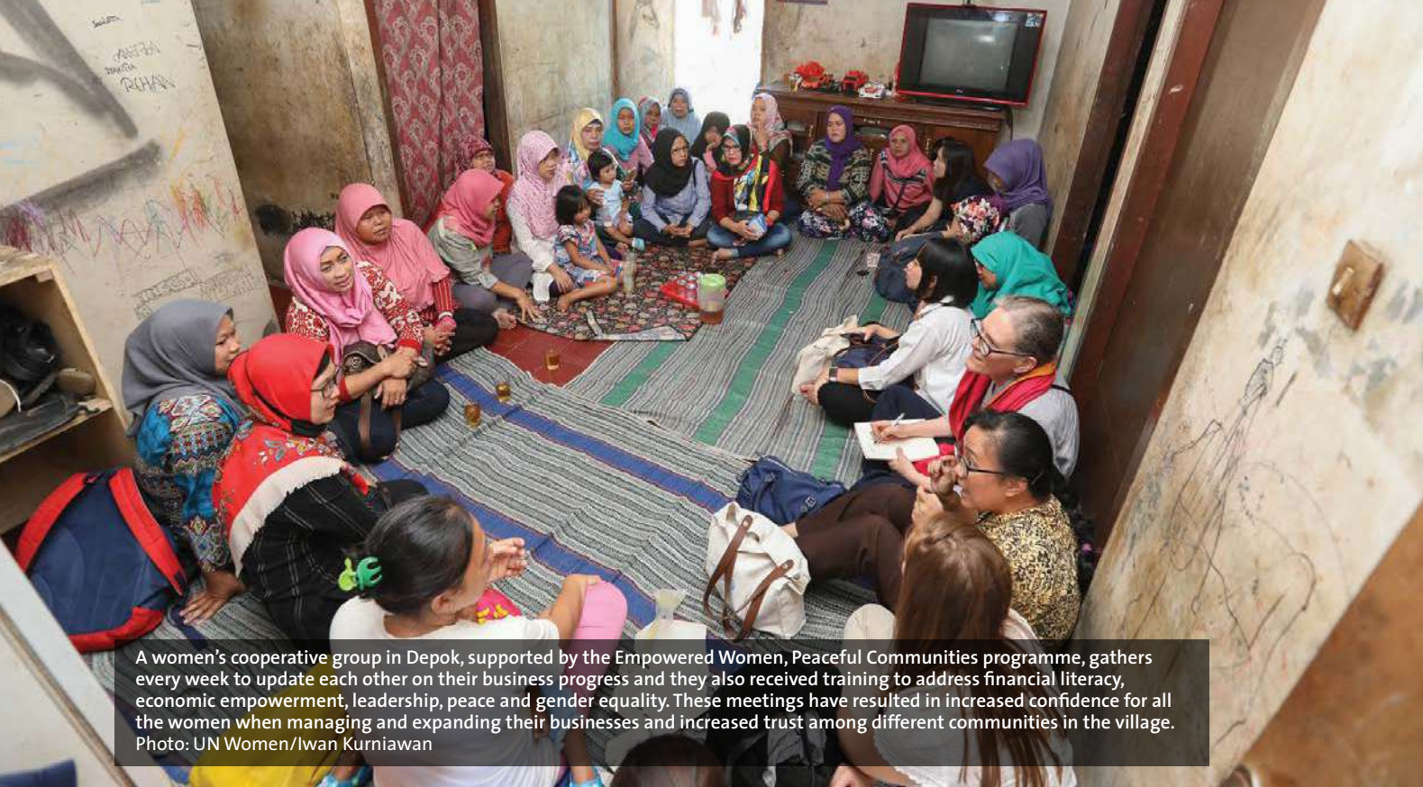
A women's cooperative group in Depok, supported by the Empowered Women, Peaceful Communities programme, gathers every week to update each other on their business progress and they also received training to address financial literacy, economic empowerment, leadership, peace and gender equality. These meetings have resulted in increased confidence for all the women when managing and expanding their businesses and increased trust among different communities in the village.

In villages where the programme has been active, early assessments found that 45 per cent of women participants strongly agree that they now know more about what to do in order to prevent violent extremism in their families, compared with only 29 per cent of women in villages outside the programme. Similar results were found in their communities, signaling women's capacity to influence public opinion.