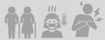
The highest numbers of deaths occurs among elderly and people with pre-existing medical conditions.

Accurate and complete sex-disaggregated data is needed including to support knowledge on age differentials as the severity of infection is associated with age (60+ years) and underlying conditions. It is important to pay key attention to the needs of older women in light of lessons from other infectious diseases, i.e. HIV, where the infection rates among older adults - primarily women - has been a neglected area of focus and by extension a neglected area of the response.