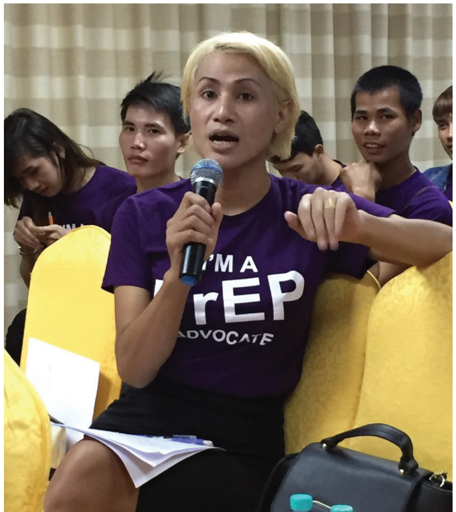
PrEP Consultation in Vientiane, Lao PDR

The countries have reported that a good way to increase both knowledge and access with regards to PrEP is through small pilot projects. These pilot projects, which can begin delivering PrEP to key populations in a number of cities, will build momentum and demonstrate that PrEP can be successfully delivered in local Asian context.