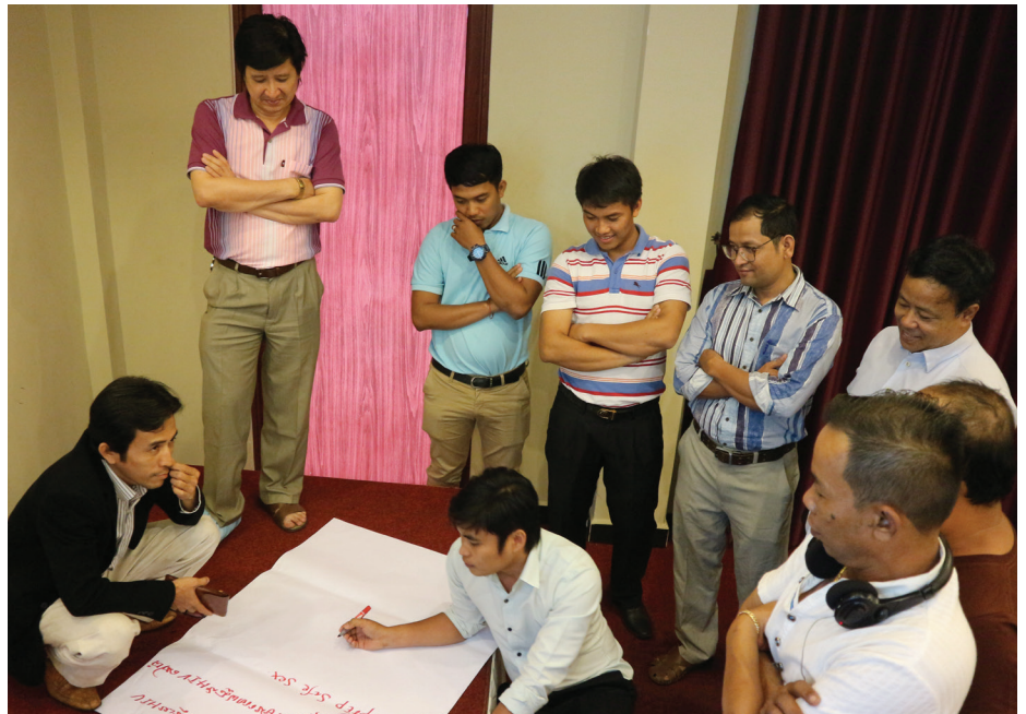
PrEP Consultation in Phnom Penh, Cambodia

Hong Kong SAR and Mongolia have reported a lack of detailed information on MSM and transgender knowledge in terms of willingness to take PrEP, while Indonesia and Myanmar have used feedback from community consultations to improve community awareness and readiness for PrEP. The majority of countries within the region report that MSM and transgender community knowledge about PrEP needs to be enhanced, so that accurate information is available and demand can be generated. Lack of community exposure and awareness has been reported as a significant barrier by over half of the responding countries.