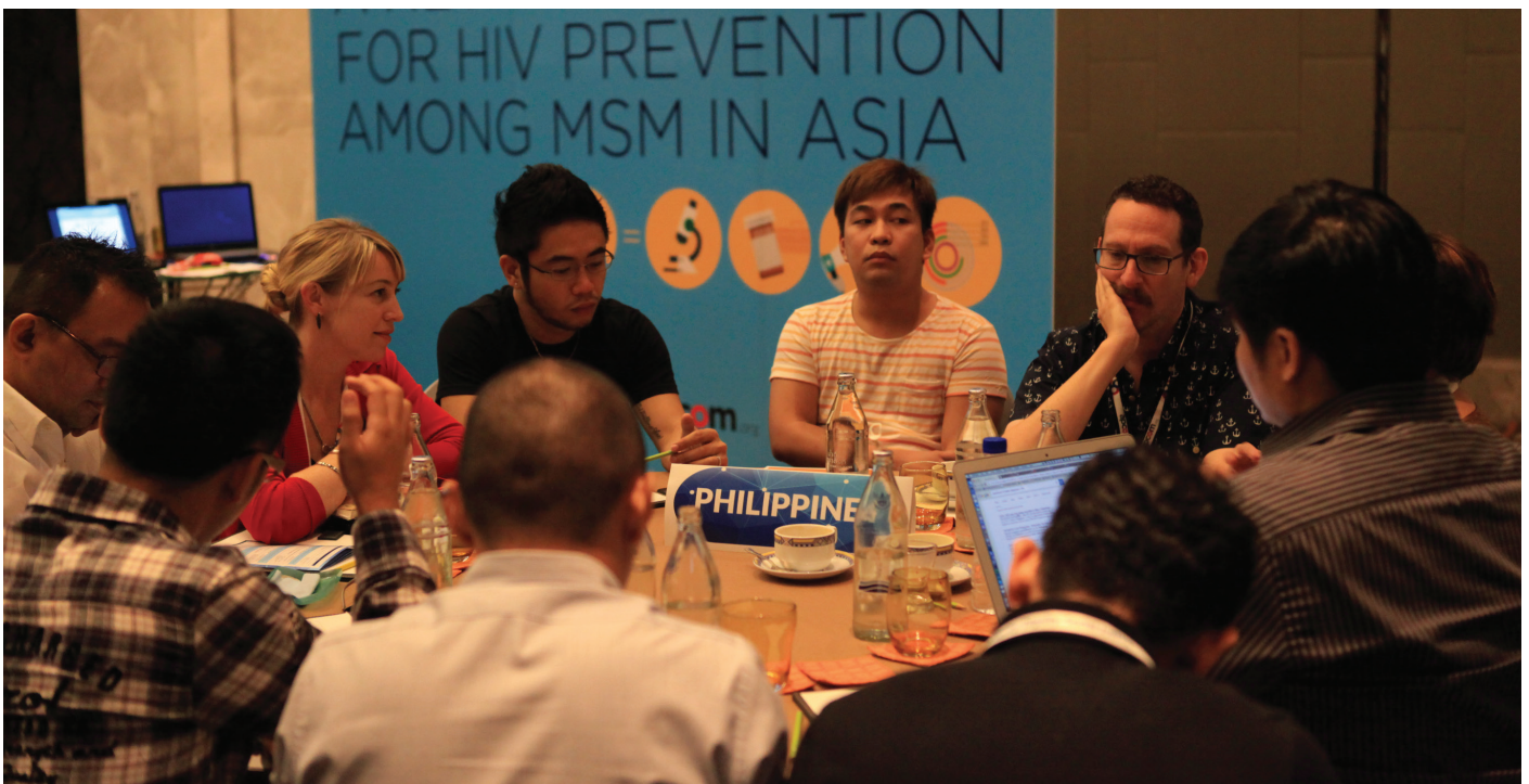
Philippines's working group at PrEParing Asia Consultation 2015 Bangkok, Thailand

At least half of the 12 responding countries have reported significant progress toward establishing pilot projects that can begin delivering PrEP to key affected populations in a number of major cities. This momentum will help to encourage similar projects in other countries, while also strengthening the evidence base for scaling up PrEP delivery and services.