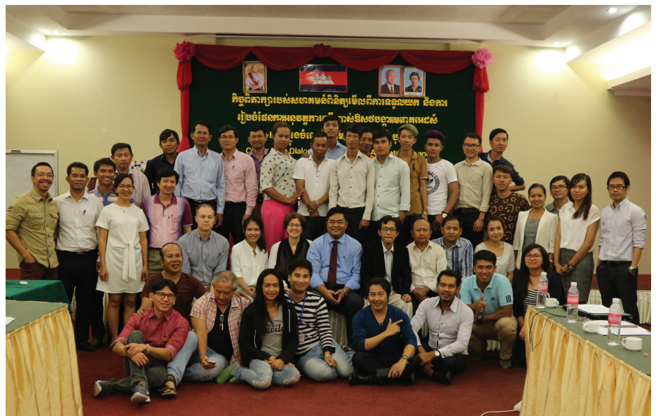
PrEP Consultation in Phnom Penh, Cambodia