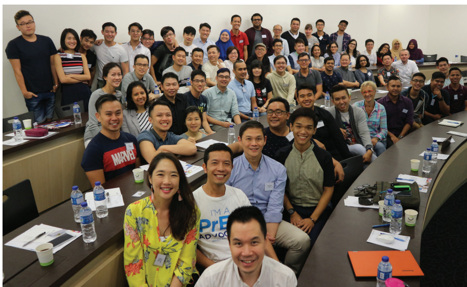
PrEP Consultation in Singapore

The main goals of country consultations have been to share information about PrEP, as well as to seek consensus and collaboration in devising strategies for the introduction and provision of PrEP within their respective national contexts. Where this has happened, positive steps and measures have been taken, like in Malaysia where the consultation resulted in an agreement to develop and implement training for healthcare service providers on HIV care and PrEP. The Malaysian Society of HIV Medicine (MASHM) is set to develop training modules which will become part of their plan to improve HIV care in private General Practitioners' set ups. The Malaysian AIDS Council (MAC) will provide a list of community friendly clinics nominated by community members themselves. Once the training is completed, the services will be strategically marketed, using the brand to motivate other GPs to join.