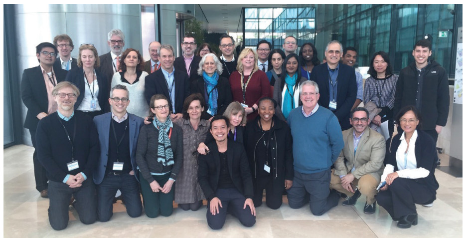
Group photo of the participants at the UNAIDS-WHO Geneva, Switzerland