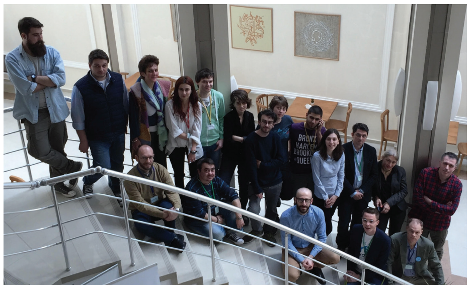
PrEP Workshop in Tbilisi, Georgia

The participants in the training included specialists, experts, and activists, who will later be involved in developing and implementing the pilot project: employees of clinical services institutions that provide assistance to people with HIV, epidemiologists, representatives of LGBT organisations, a representative of the LGBT community in the Georgian CCM, and specialists from service NGOs working with MSM on HIV and STI prevention. As a result, Georgia will have a PrEP Working Group to guide the implementation of PrEP in the country.