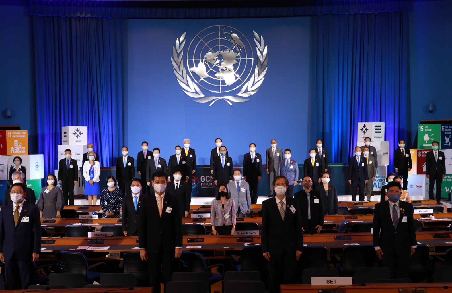
Business leaders show commitment to lead Thailand towards the Sustainable Development Goals at the 'GCNT FORUM 2020: Thailand Business Leadership for SDGs' in August 2020.

including South-South and Triangular Cooperation, the Gender Scorecard, Youth and Partnerships. The UNCT and Thailand International Cooperation Agency completed an analysis this year to inform the UN's South-South and Triangular Cooperation approach by assessing current interventions, existing gaps and how to best bridge them through a collaborative approach in the next Cooperation Framework.