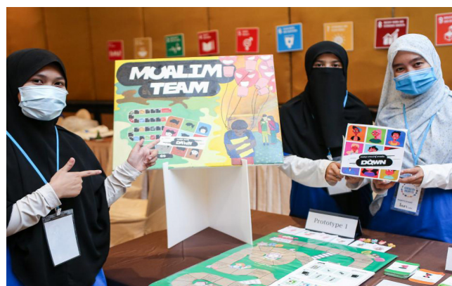
As part of Generation Unlimited, a team of students from Fatoni University in Pattani province nurture the peaceful dialogue skills among children from an early age. Through surveys with teachers and parents, they found that textbooks and workshops on bullying prevention are often not age appropriate for primary school children, who are likely to lose focus.

To address already vulnerable groups of displaced persons, UNHCR worked with Government and partners to protect refugees and asylum seekers as well as stateless persons and to advocate for inclusion in the national COVID-19 response plan. UNHCR also supported government-led COVID-response efforts to protect refugees on the Thai-Myanmar border by providing face masks to about 90,000 refugees, sanitary napkins to more than 26,000 women and emergency care assistance to almost 4,400 vulnerable people. In urban areas, cash assistance was extended to more than 2,800 vulnerable refugees and families, while 2,260 care packages were distributed to stateless persons and host communities in border provinces. Resettlement operations were able to continue despite COVID-19 restrictions, with IOM supporting 1,190 refugees with safe travel, and cultural orientation classes provided for 545 refugees.