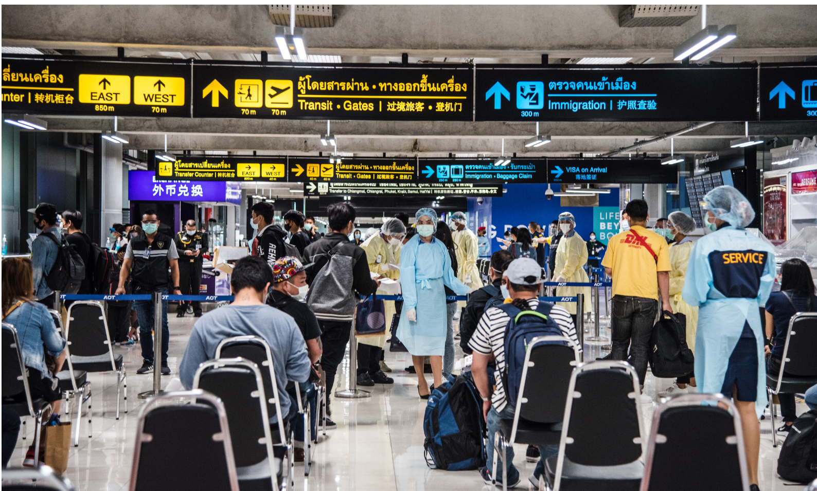
Health forms are given to passengers who arrived on a flight from Taiwan at Bangkok Suvarnabhumi International Airport in Bangkok on 8 July 2020. Special attention is being given to detecting novel coronavirus infections.