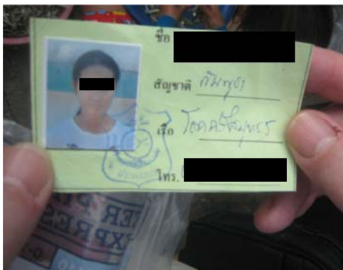
A copy of monthly card for a fisherman in Rayong

In Ban Phe district, Rayong, the local card is known as the badt rai duan [monthly card]. Fishermen and their families pay between 200 to 300 baht per person per month. NGO workers in the area told Human Rights Watch that representatives of the fishing boat or fishing pier collect monthly fees from fishermen and their shore-based family members and money is sent to the TFA. Migrant workers and NGO representatives told the researcher they believe financial arrangements are made between the TFA and local police to not arrest migrants carrying up-to-date monthly cards, but admit they do not have concrete evidence this corruption occurs. 49 Migrants report that if police come from other areas, such as the Muang district of Rayong, the monthly card will not protect them from arrest. 50 Copies of the monthly card seen by the researcher in Rayong in January 2009 list the migrant worker's name and nationality, the name of fishing boat to whom s/he is attached, the workers' photo, the name and phone number of the sponsor/boat owner, and a stamp of the Rayong branch of the TFA. The back of the card has a monthly date stamp (reflecting whether the card is current or not) and the words "fishing activities" on it.