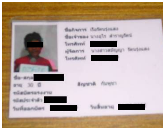
Copies of ID cards for fishermen in Pattani

Ranong province has a local migrant worker ID card known as badt kwaen kor (card hanging around the neck) issued by a previous Governor. However, according to media reports, this card has now been revoked in favour of the national migrant worker ID card. When it was in use, the badt kwaen kor was similar to the cards in Pattani and Rayong, usually (but not always) offering protection from arrest by local police in certain areas of Ranong. The degree of